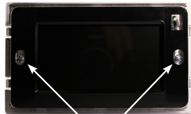
Remove faceplate to reveal wall fixing holes

To avoid damage to the display, it is recommended that the touchscreen is installed after painting/wallpapering has been done.