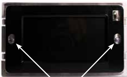
Wall fixing holes behind face plate