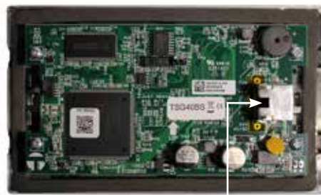
CAT5, RJ45 Connection to HVAC-1