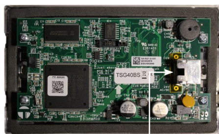
CAT5, RJ45 Connection to HVAC-1