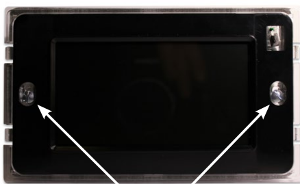
Wall fixing holes behind face plate